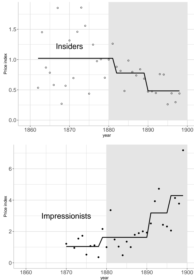
Figure 3: Bai-Perron test of structural breaks: Impressionists vs. Insiders

Notes: The estimates refer to the Paris market.