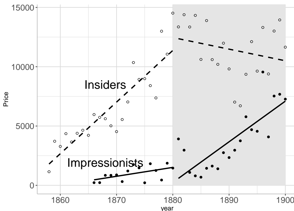
Figure 1: Trends in average prices: Impressionists vs Insiders

variables are the same as before. The coefficient \rho is the DiD treatment effect estimator that amounts to: